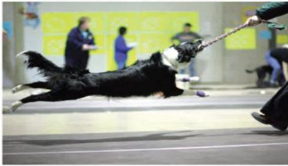
Fast-paced competitive action