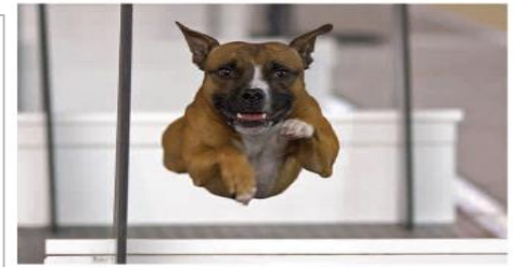
Open to all breeds & sizes

A not-for-profit organization, since 2001, dedicated to training, demonstration, & competition of dogs in flyball & educating the public on canine welfare.