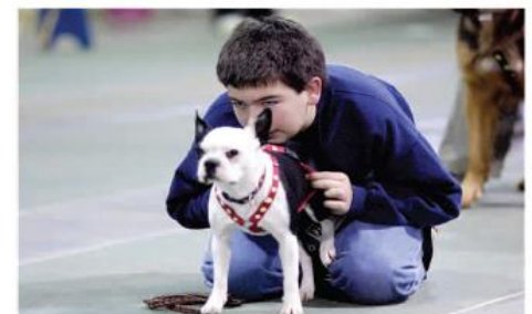
Fun for the whole family

Insurance: Available upon request References: Available upon request